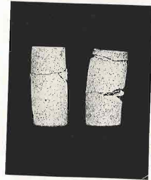
FIG. 2. Sandstone cylinders shortened 15 per cent under 46,000 lb/in 2 (9R) and 56,000 lb/in 2 (10R) confining pressures.

(a) Apparatus. Uniaxial testing of rock cylinders was carried out by means of a hydraulically driven 100-ton Avery testing machine capable of applying loads in five different ranges at a constant rate. The load on the ram can be read directly from an indicator rotating on a calibrated chart. The triaxial apparatus was designed and described in detail by