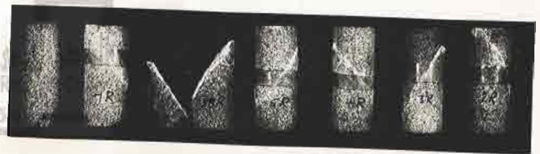
FIG. 3. Sandstone cylinders compressed till failure under different confining pressures (see Table 1).