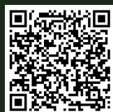
Scan QR Code

For more information about the conference and the Paper Template, please visit the conference website: